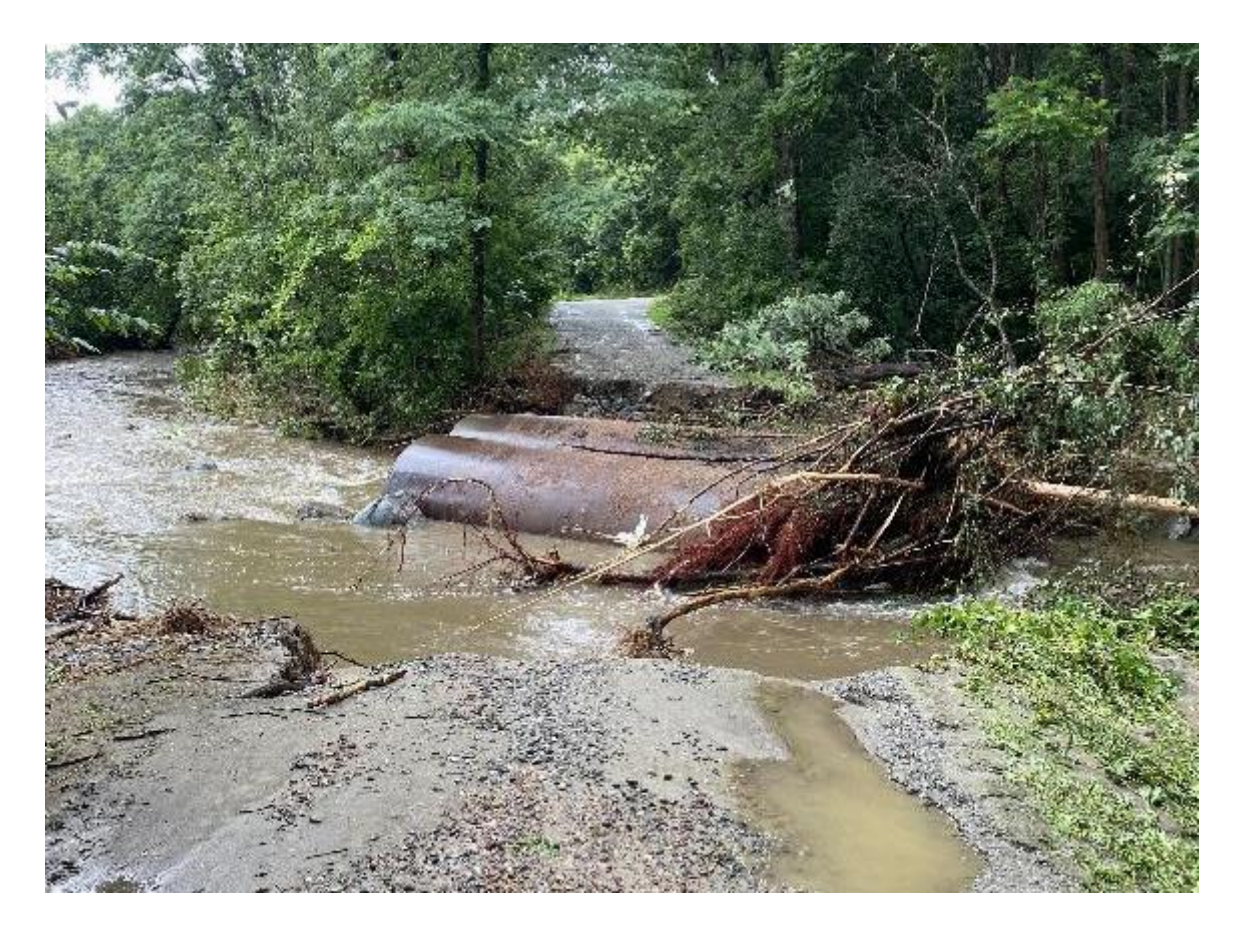
10 homes remain isolated on Oneil Dr. today. Only access to the is in a makeshift path through residents' yards on Lily Pond Cir.