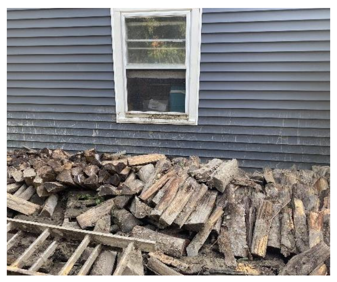
Furnaces, furniture, flooring, drywall destroyed and removed in 6 homes