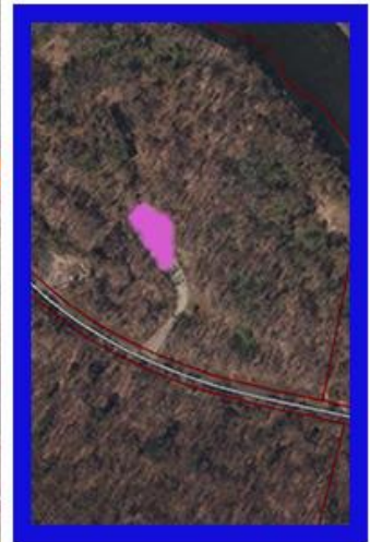
- Designated Parking Areas