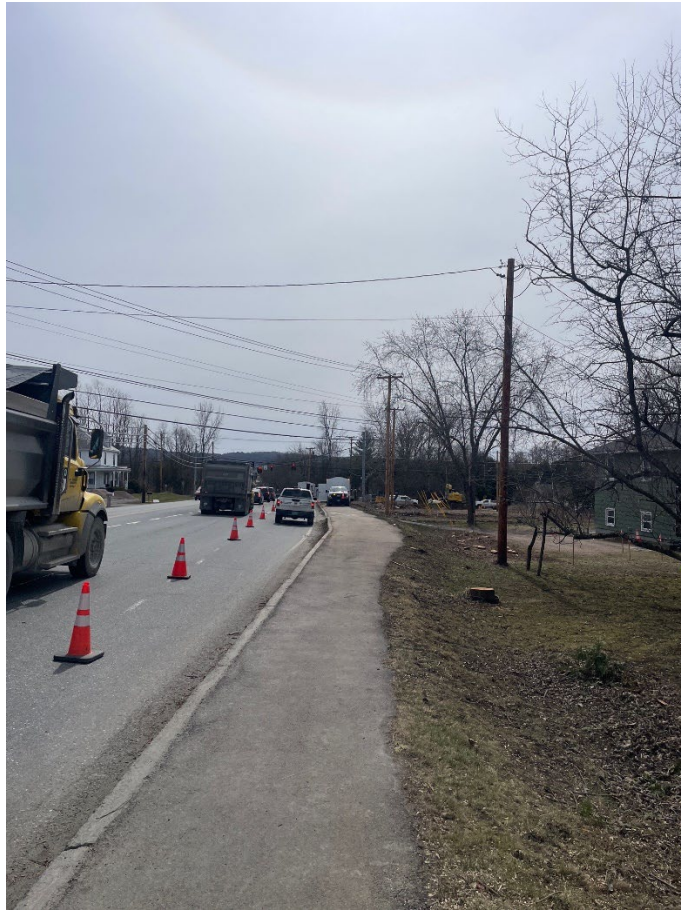
Crews mobilize to the project limits on VT 2A near Industrial Avenue in Williston, VT.