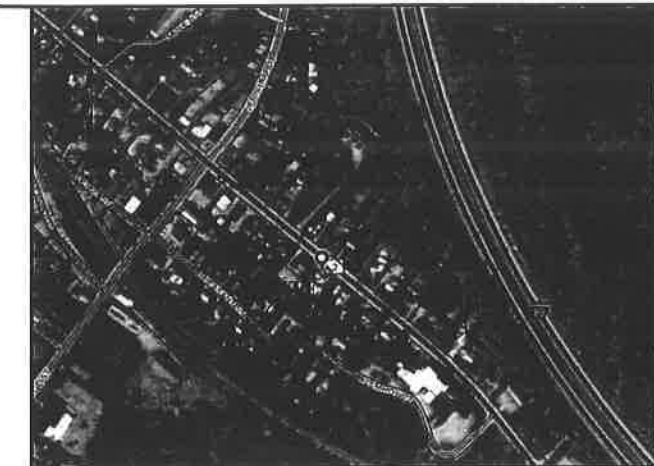
LOCUS NOT TO SCALE

SUBJECT PARCEL PARCEL #8.2-EM0112 ALLEN & LYNNE KNOWLES FAMILY TRUST III, BLAIR KNOWLES & MATT PARISI 15697± Sq. Ft. 0.36± Acres Vol. 256, Pg. 234